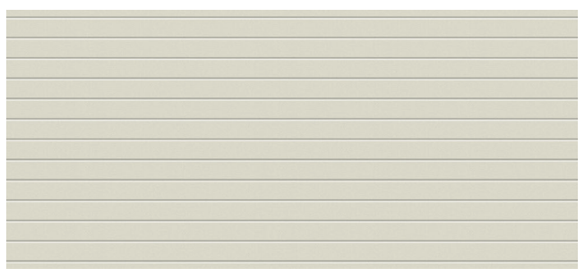
Slimline (smooth or textured finish)