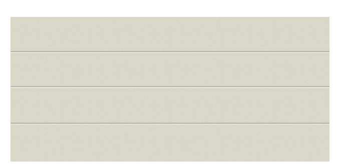
Flatline (smooth or textured finish)