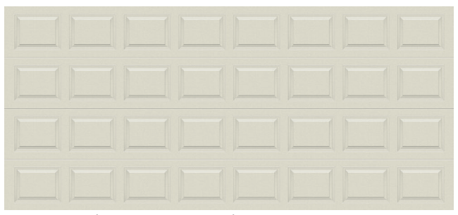
Heritage (textured finish)