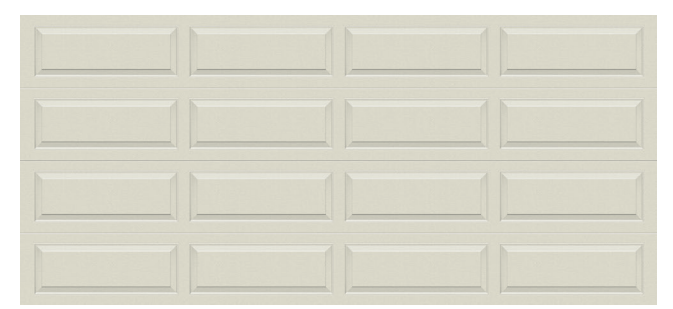
Ranch (textured finish)