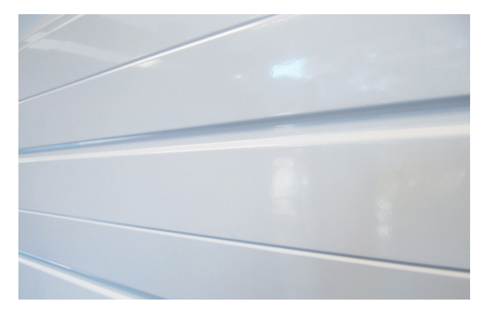
Smooth Finish | Glacier