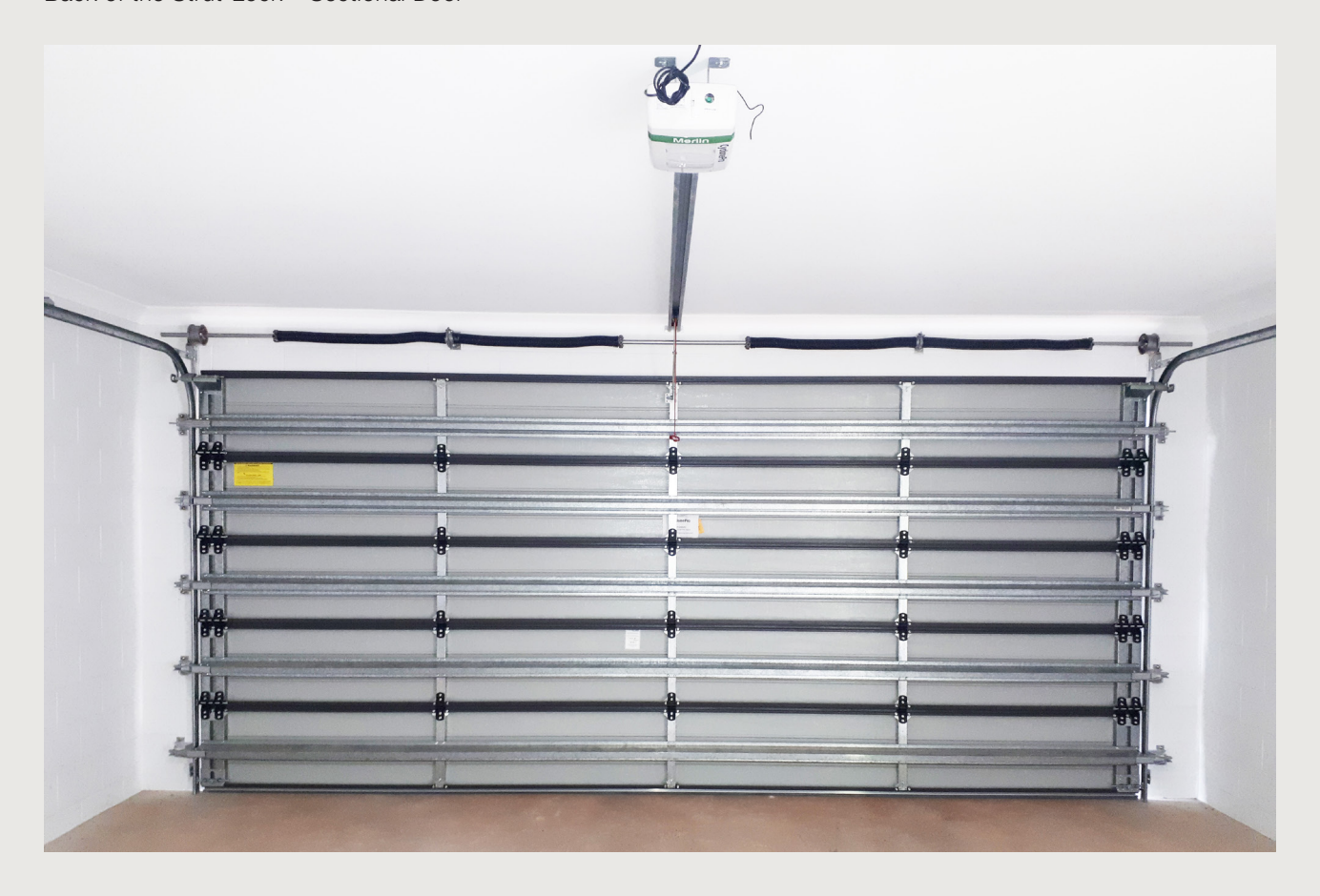
Wind Brace Design

Back of the Strut-Lock ^{\text{TM}} Sectional Door