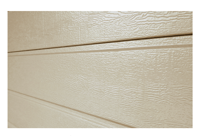
Textured Finish | Slimline