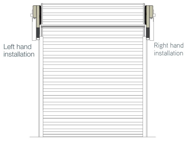
Max Door Height: 5.5m