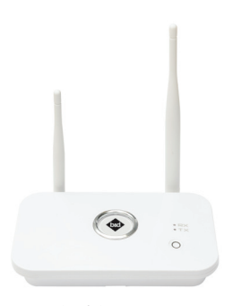
B&D® Smart Hub